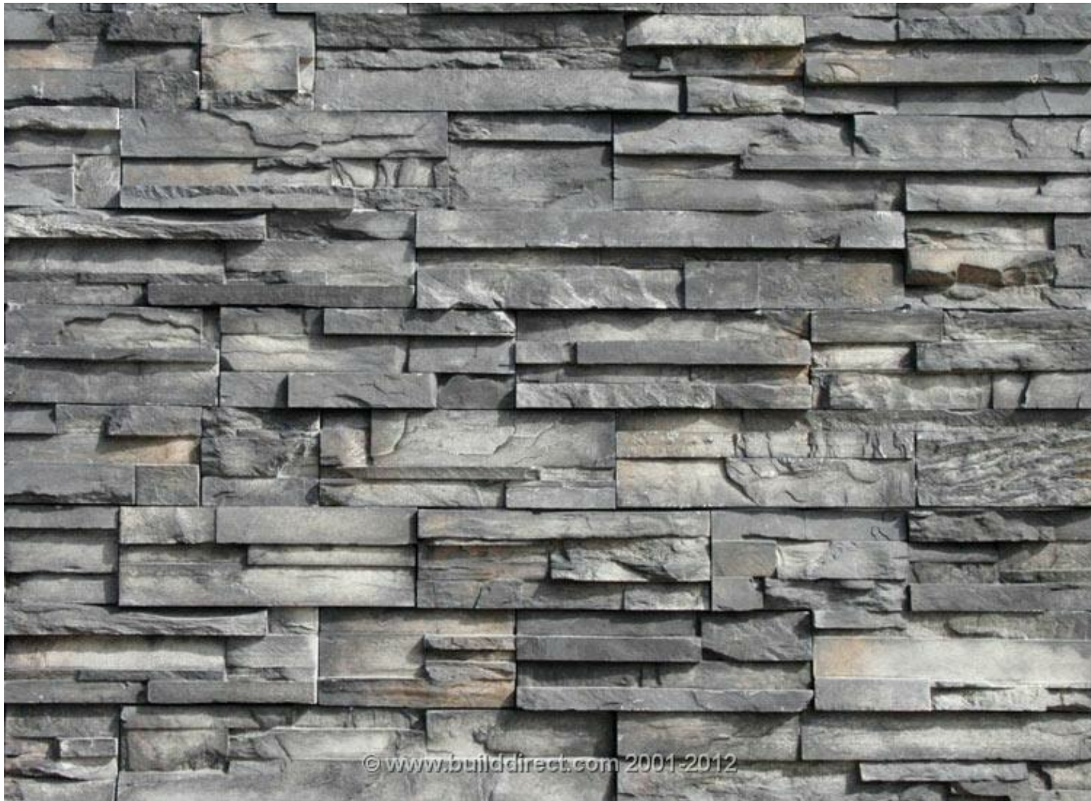
STACKED STONE VENEER: C