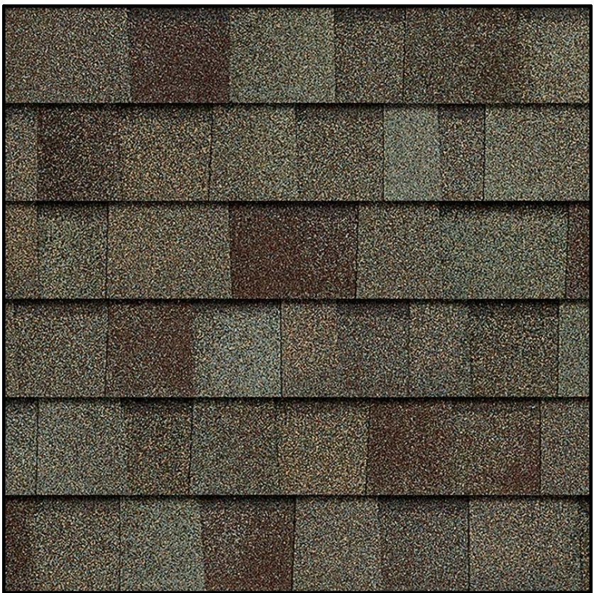
ROOFING - OWENS CORNING DURATION SHINGLES - DRIFTWOOD OR EQUAL