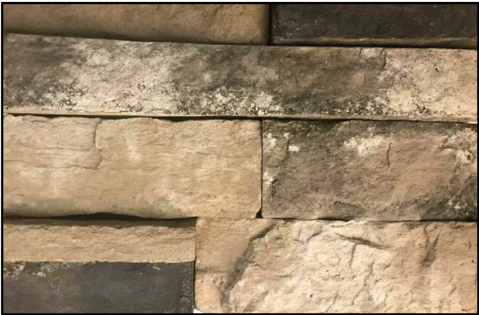
STONE VENEER - CULTURED STONE - COUNTRY LEDGE STONE - ASPEN