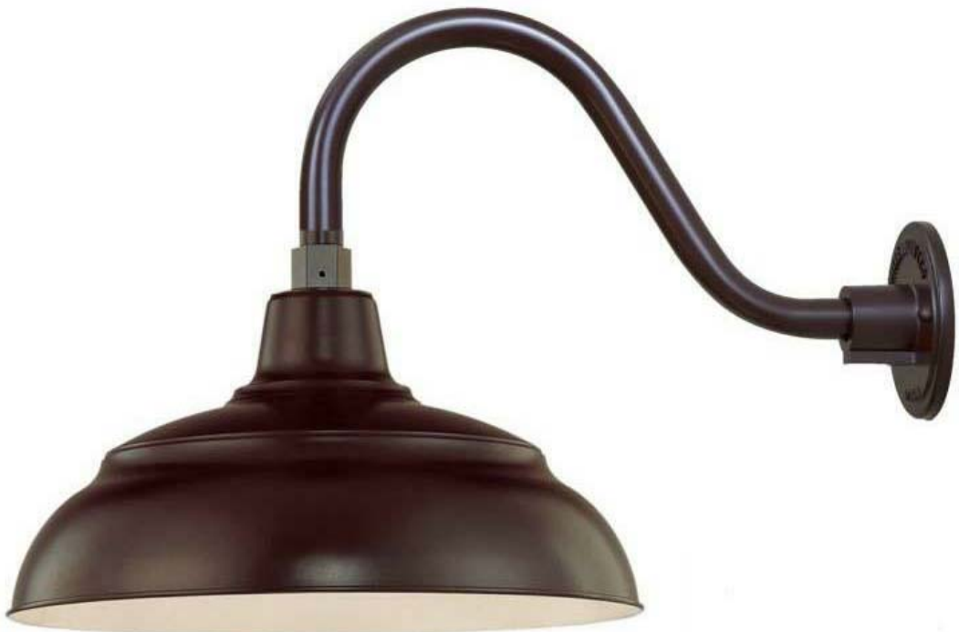
GOOSE NECK - MILLINIUM LIGHTING 14" WAREHOUSE SHADE # RWHS14 (GN) ARCHITECTURAL BRONZE W/ RGN 24 - BRONZE OR EQUAL