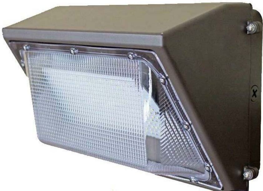
WALL PACK - LITHONIA LIGHTING 150 WATT OUTDOOR WALL PACK LIGHT #OWPC150M TB LPI- BRONZE OR EQUAL